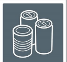
food tins & drink cans