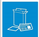
mixed paper & card