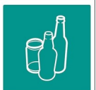
mixed glass bottles & jars