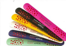
Snap band - Suggested Donation: £1.50