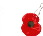
Reflector - Suggested Donation: 50p