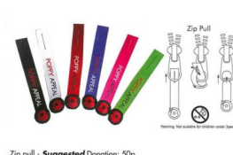
Zip pull - Suggested Donation: 50p

We will also be selling poppies and other small items for the Royal British Legion. Items range from 50p to £1.50.