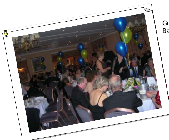
Grand Spring Ball-2006

A description of this position is enclosed in this Guide for your reference.